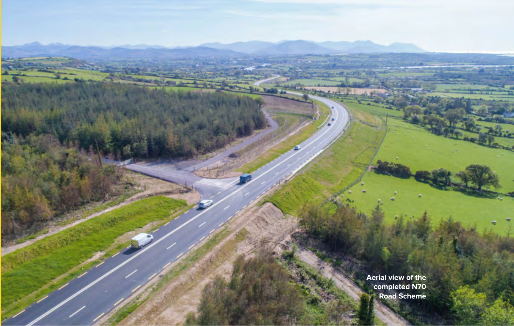
Aerial view of the completed N70 Road Scheme