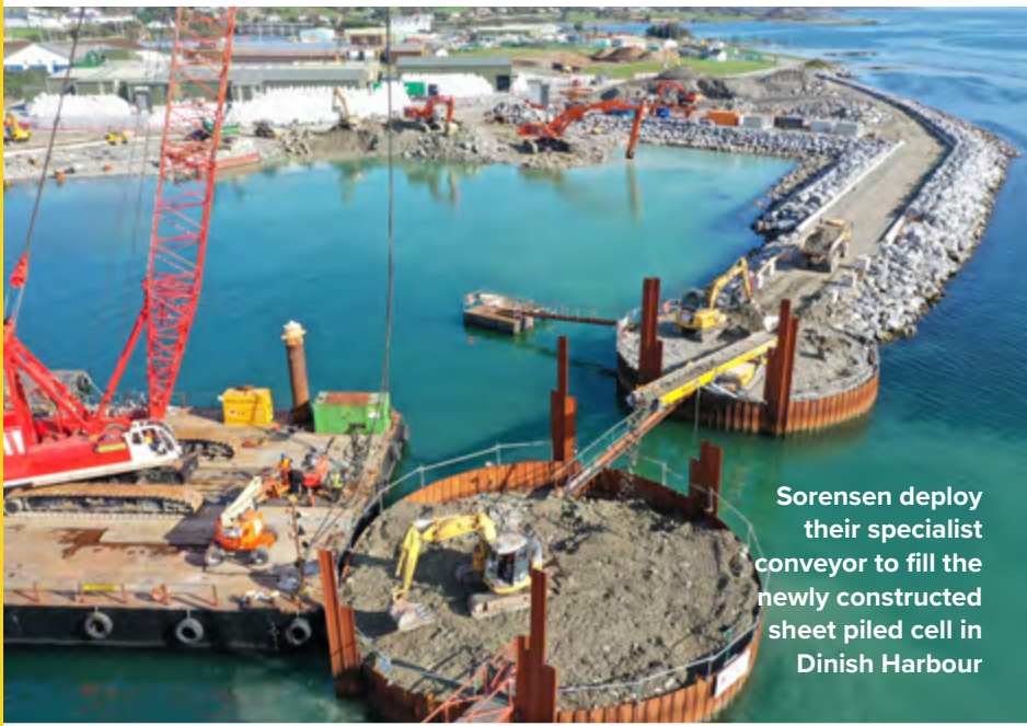
Sorensen deploy their specialist conveyor to fill the newly constructed sheet piled cell in Dinish Harbour