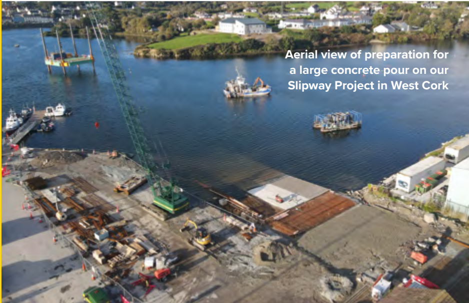
Aerial view of preparation for a large concrete pour on our Slipway Project in West Cork