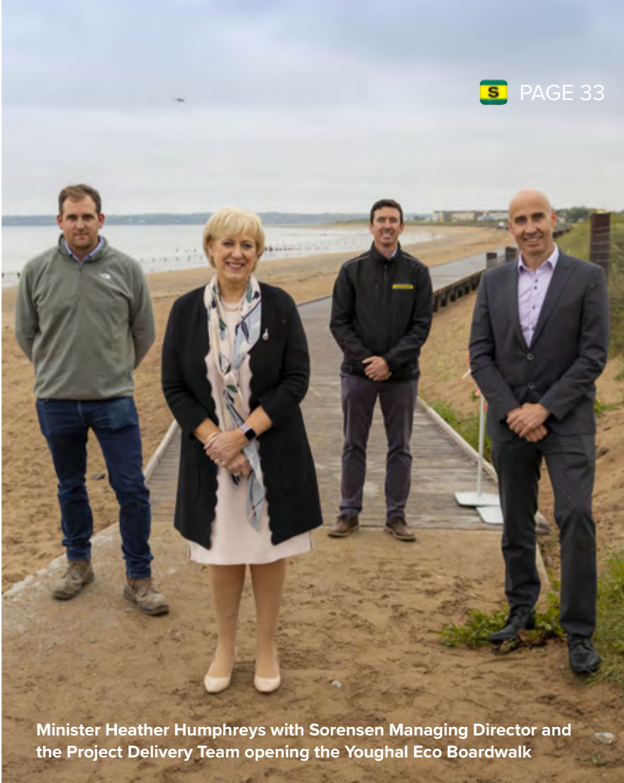
Minister Heather Humphreys with Sorensen Managing Director and the Project Delivery Team opening the Youghal Eco Boardwalk