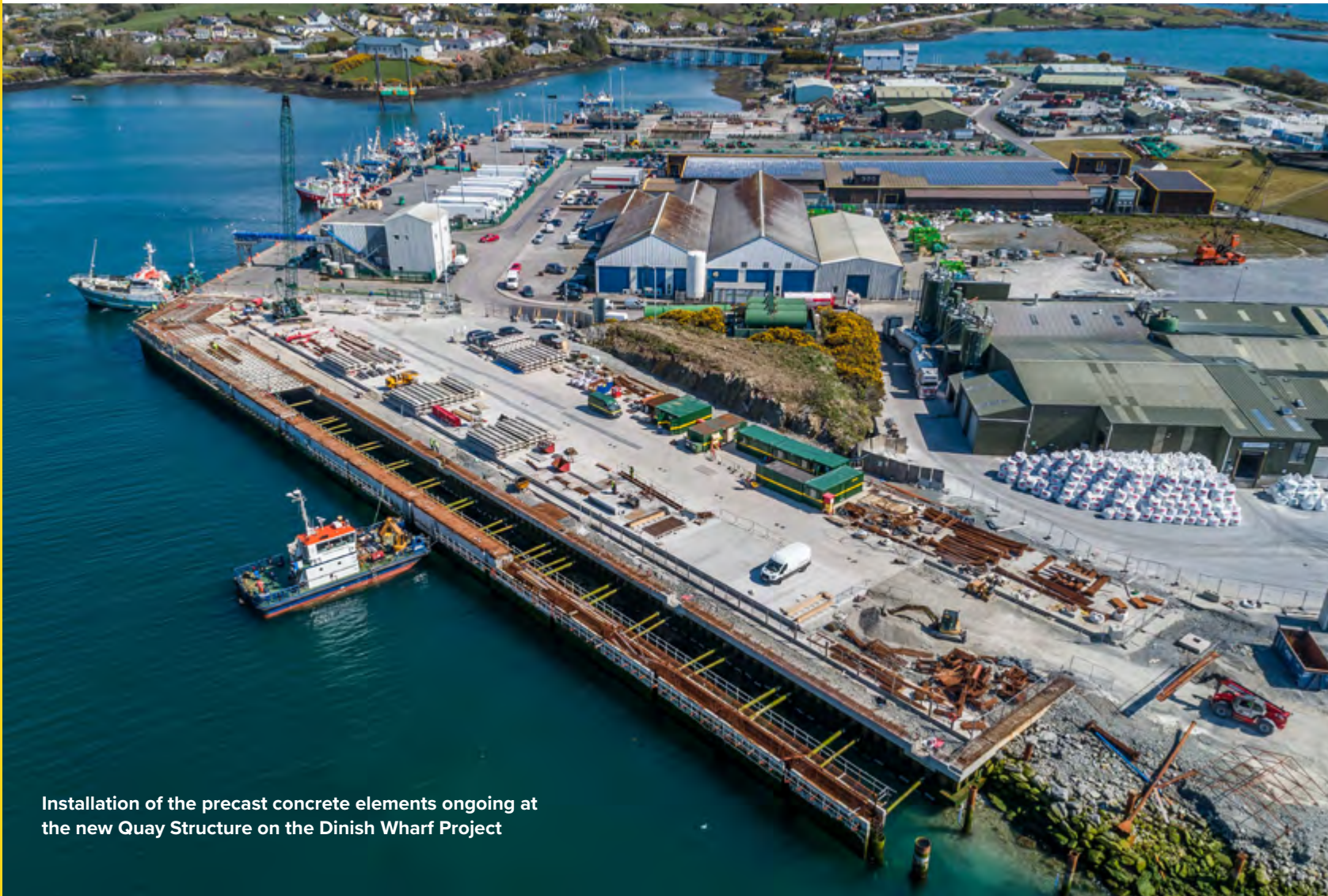
Installation of the precast concrete elements ongoing at the new Quay Structure on the Dinish Wharf Project