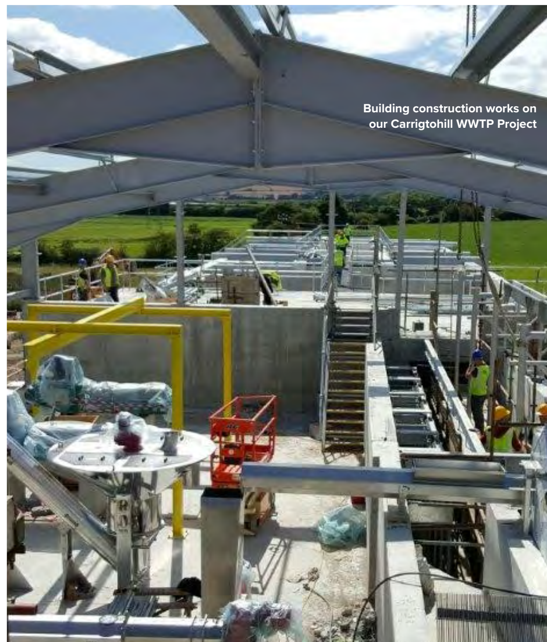
Building construction works on our Carrigtohill WWTP Project