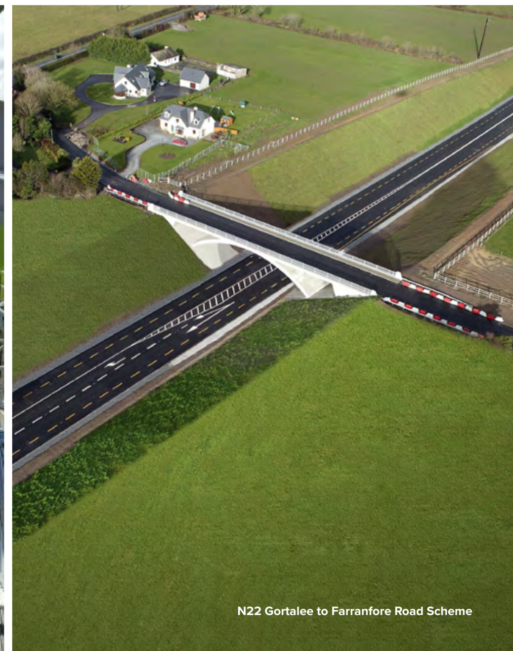
N22 Gortalee to Farranfore Road Scheme