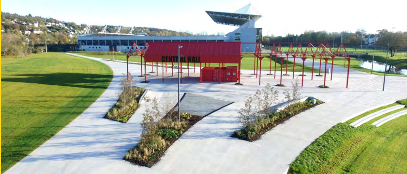
Aerial view of the Central Plaza with its distinctive red Central Hall structure at our Marina Park Project