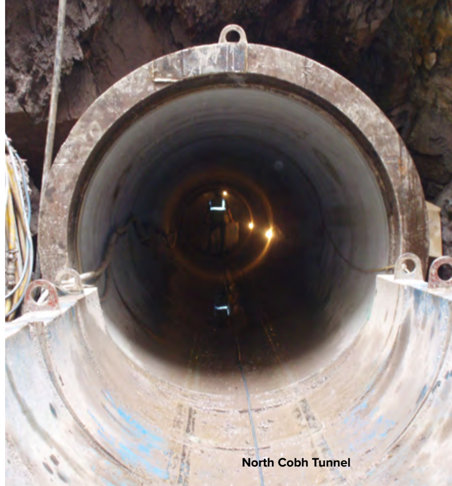
North Cobh Tunnel