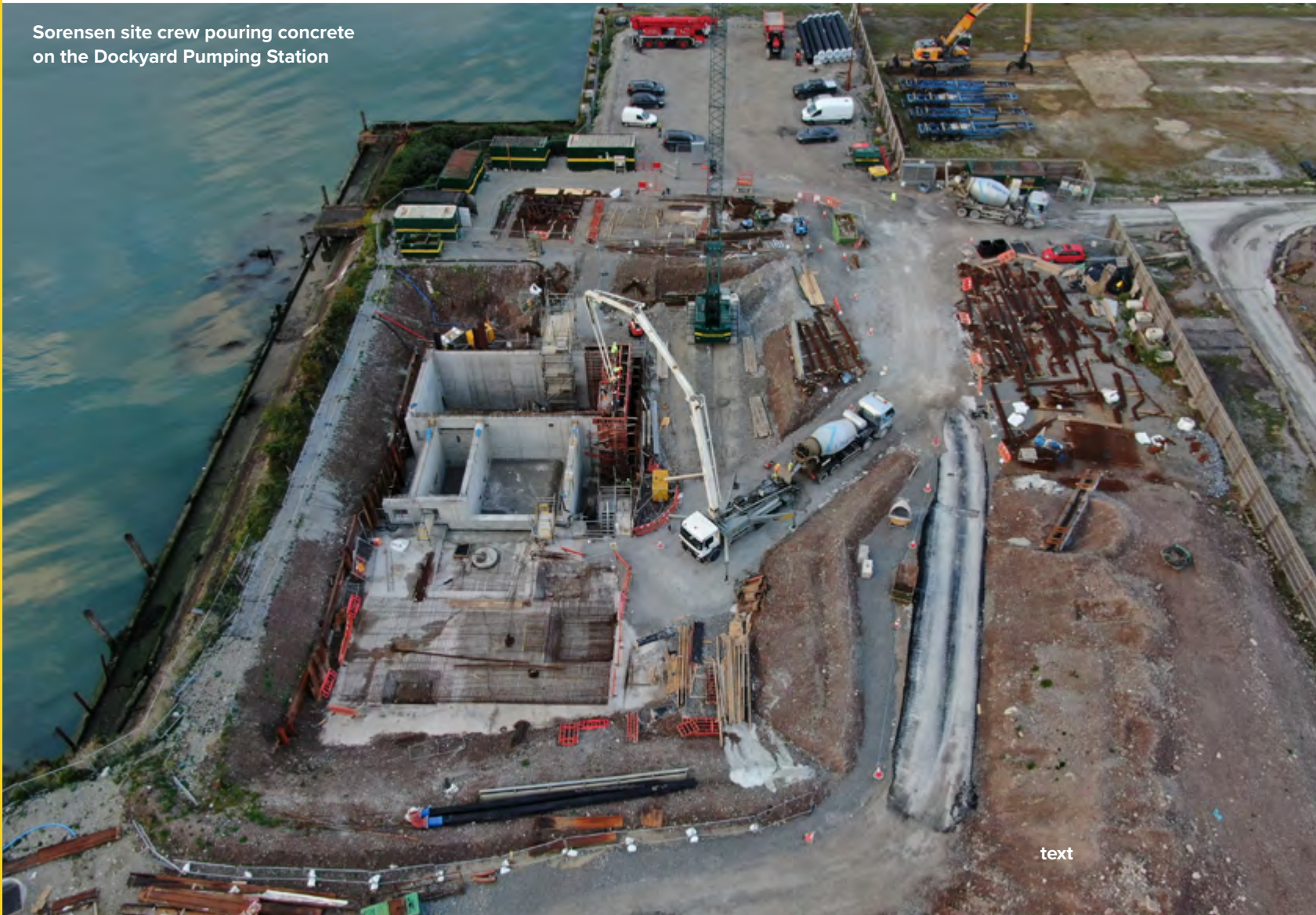
Sorensen site crew pouring concrete on the Dockyard Pumping Station