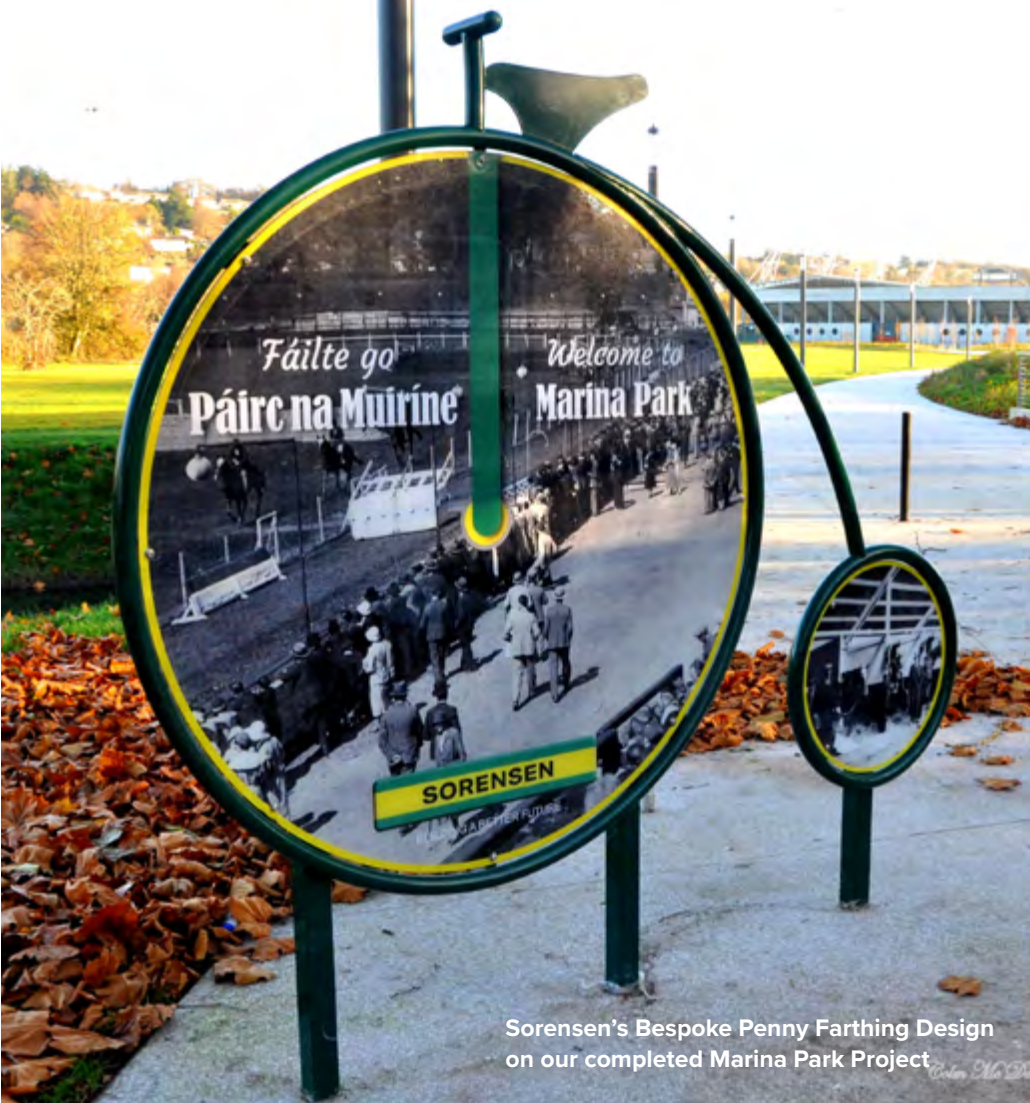
Sorensen's Bespoke Penny Farthing Design on our completed Marina Park Project