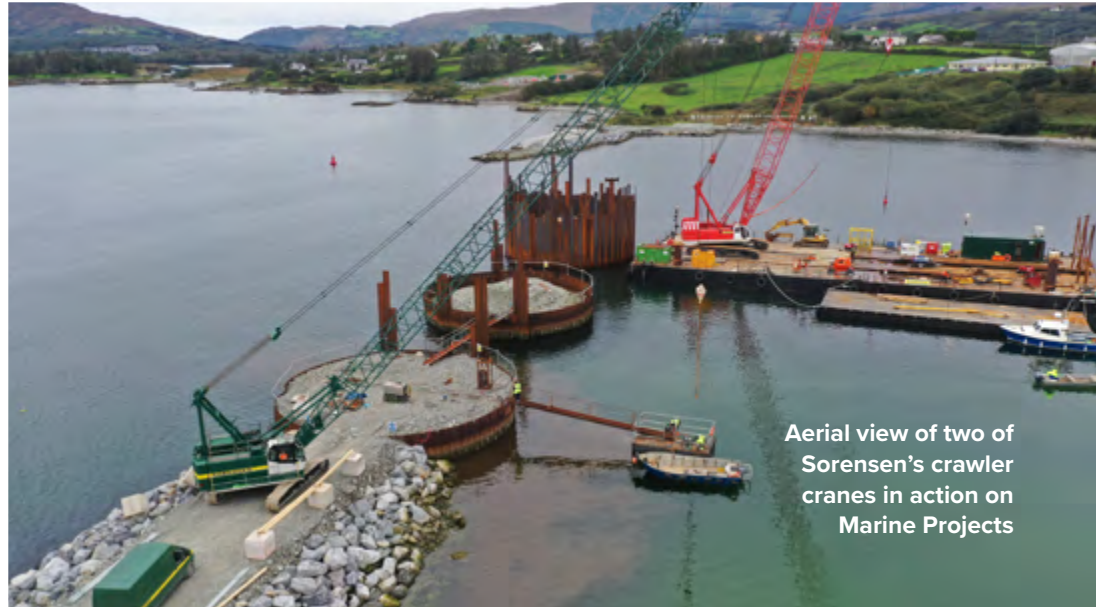
Aerial view of two of Sorensen's crawler cranes in action on Marine Projects