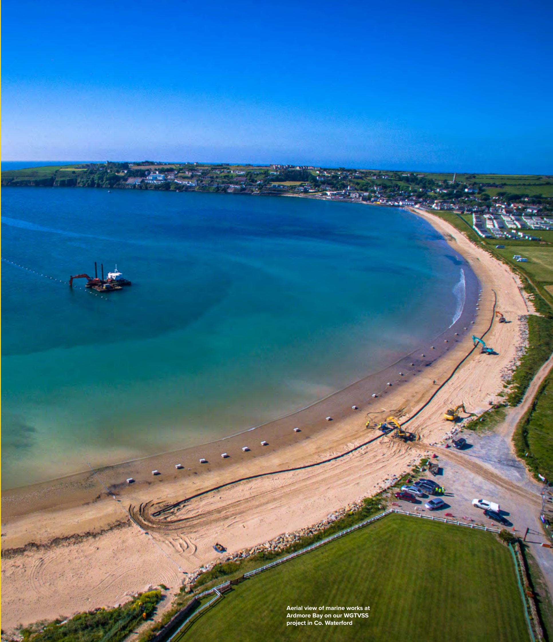
Aerial view of marine works at Ardmore Bay on our WGTVSS project in Co. Waterford