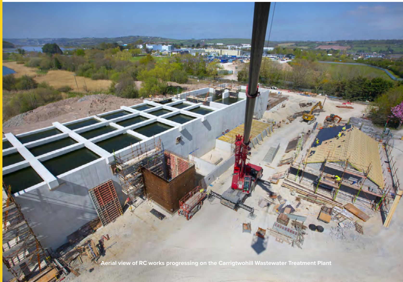
Aerial view of RC works progressing on the Carrigtwohill Wastewater Treatment Plant