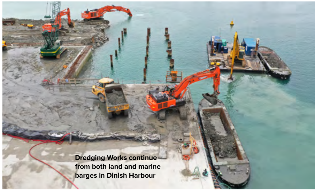
Dredging Works continue from both land and marine barges in Dinish Harbour