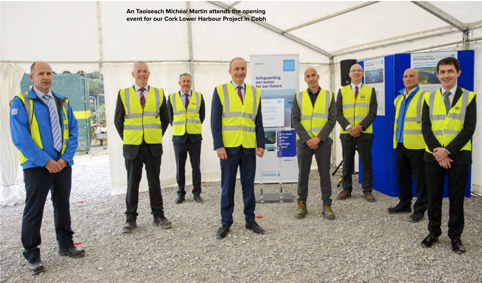
An Taoiseach Micheál Martin attends the opening event for our Cork Lower Harbour Project in Cobh