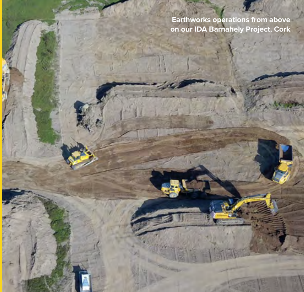
Earthworks operations from above on our IDA Barnahely Project, Cork