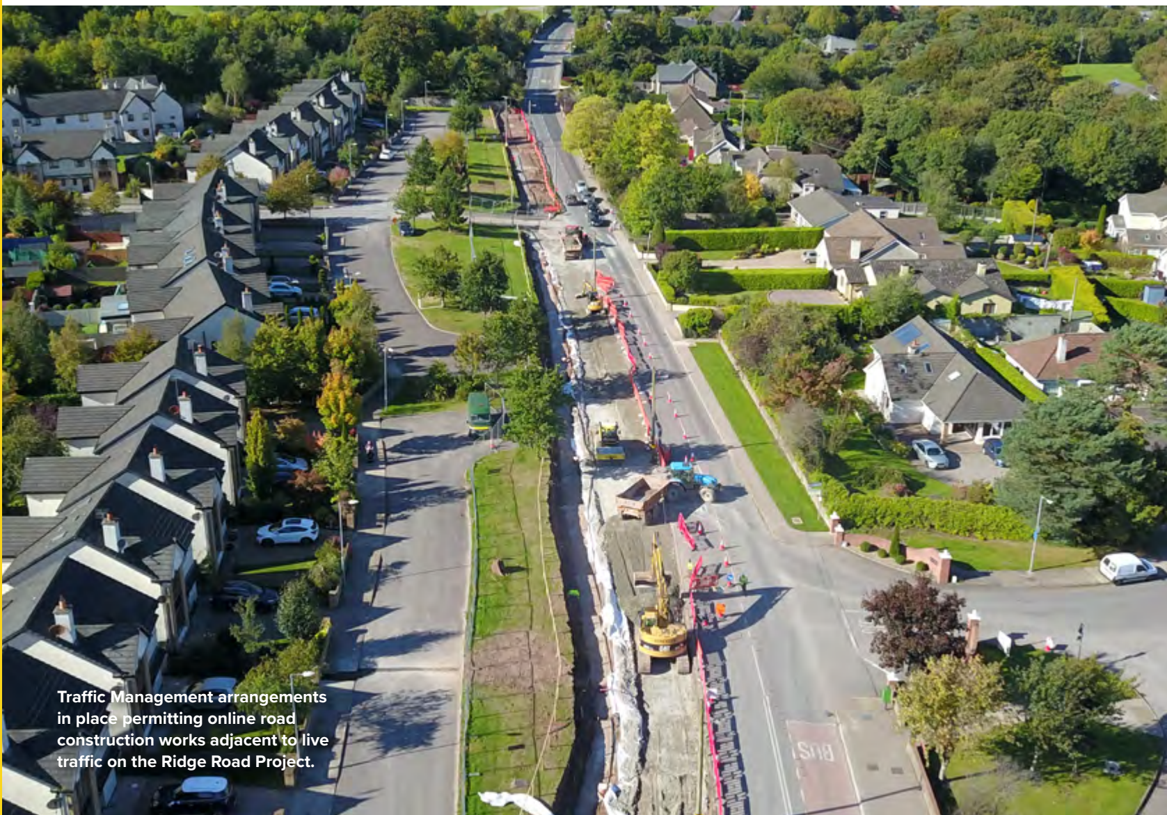
Traffic Management arrangements in place permitting online road construction works adjacent to live traffic on the Ridge Road Project.