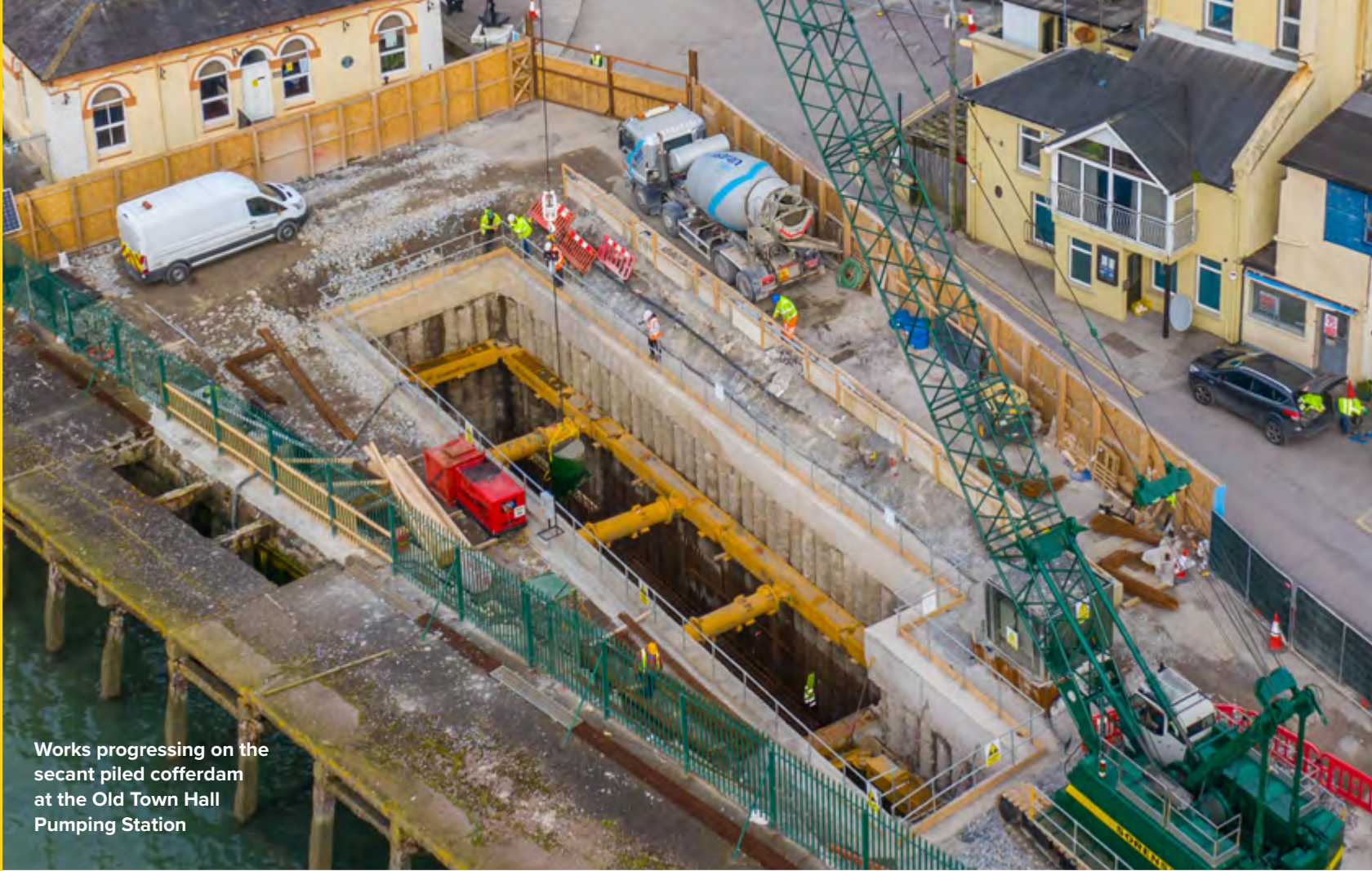
Works progressing on the secant piled cofferdam at the Old Town Hall Pumping Station