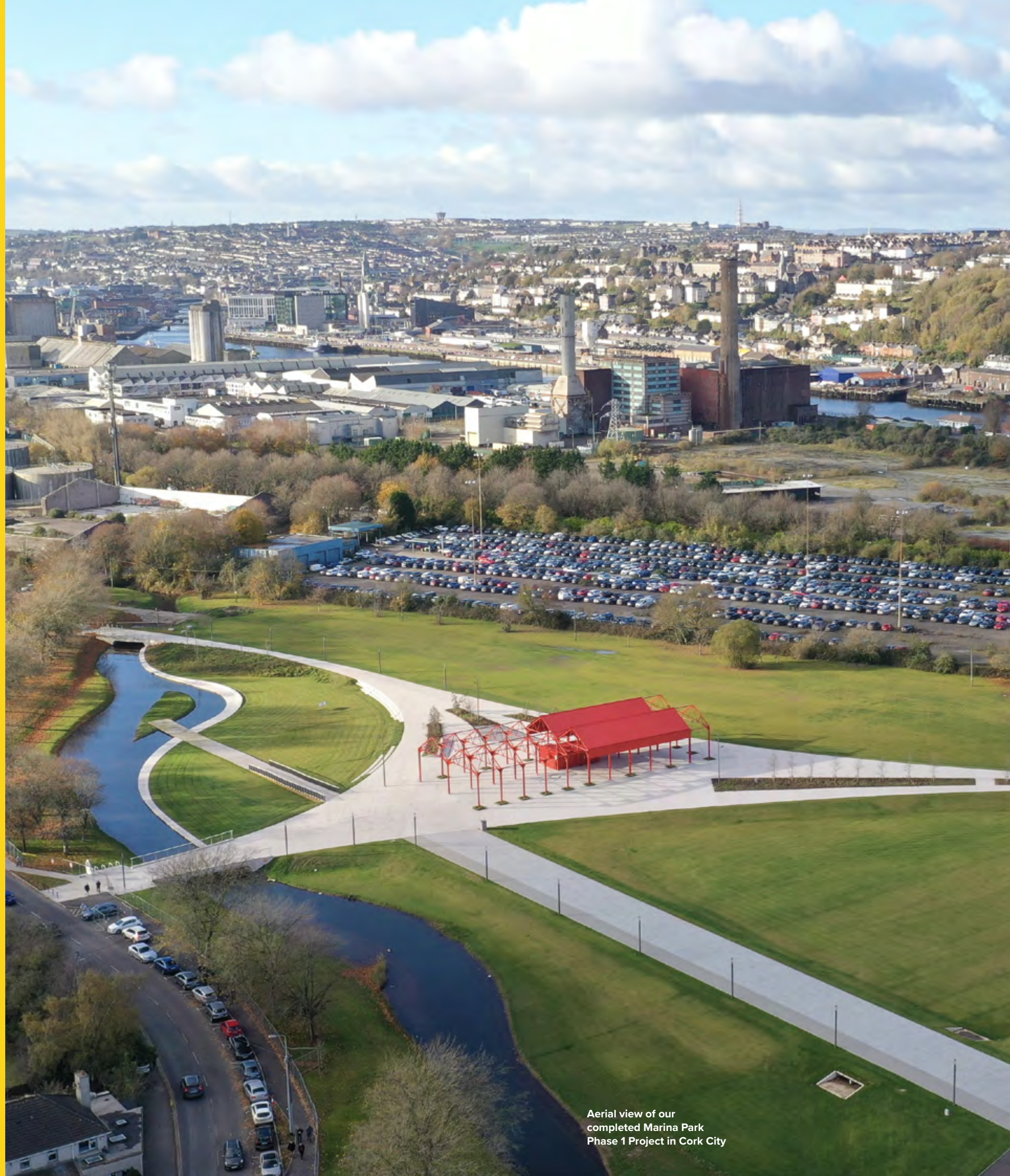
Aerial view of our completed Marina Park Phase 1 Project in Cork City