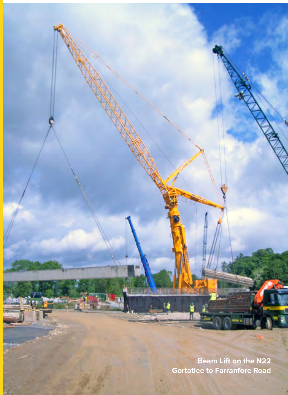
Beam Lift on the N22 Gortatlee to Farranfore Road