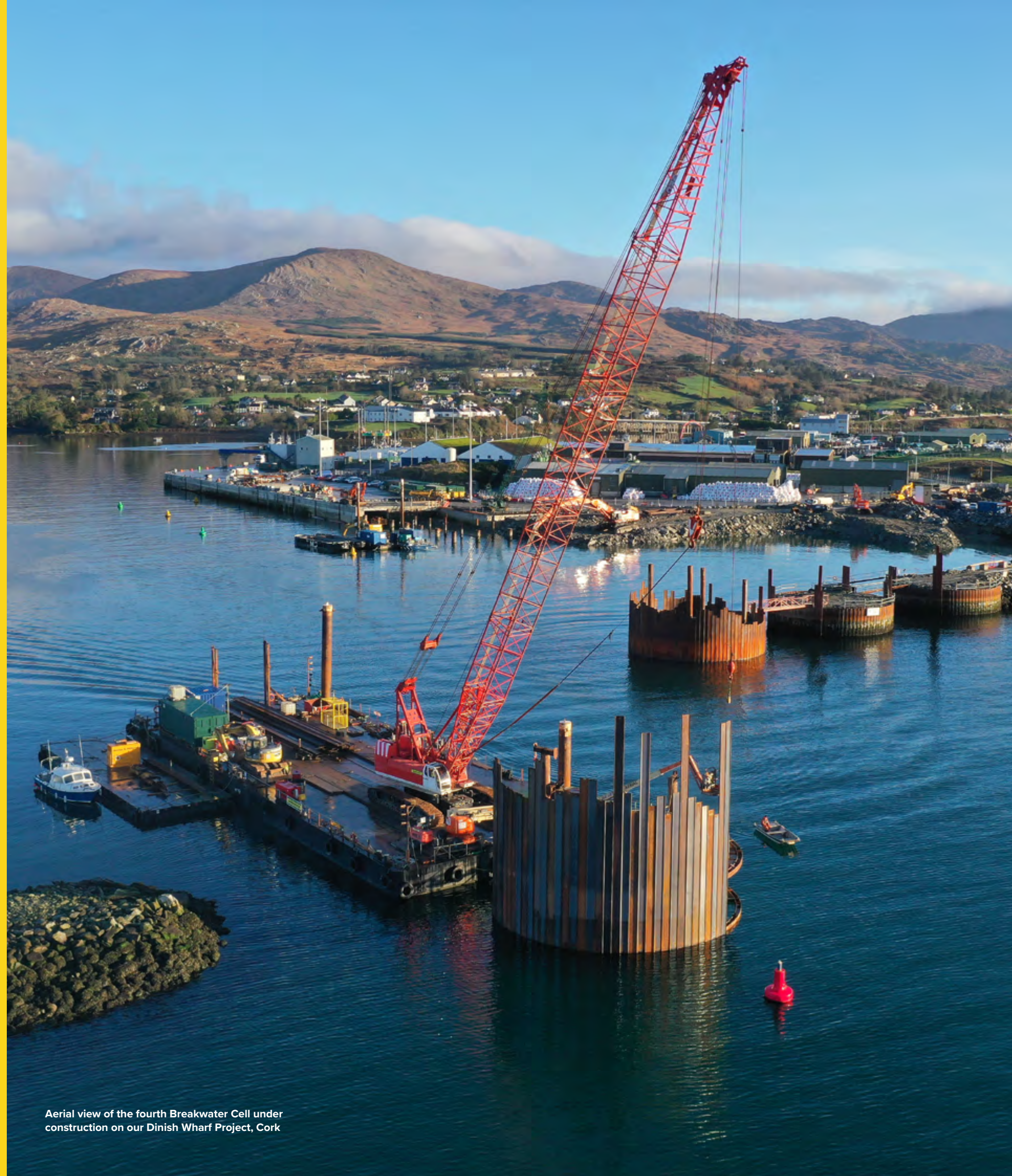
Aerial view of the fourth Breakwater Cell under construction on our Dinish Wharf Project, Cork