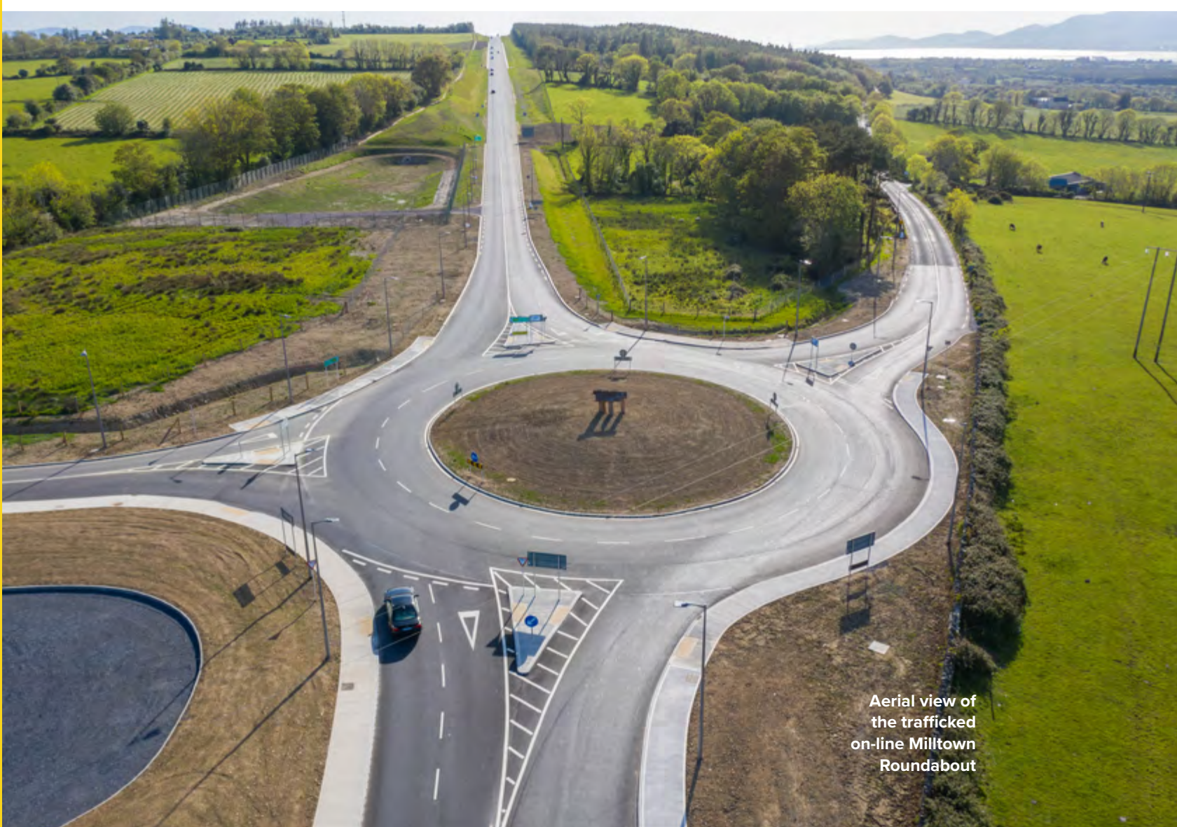
Aerial view of the trafficked on-line Milltown Roundabout