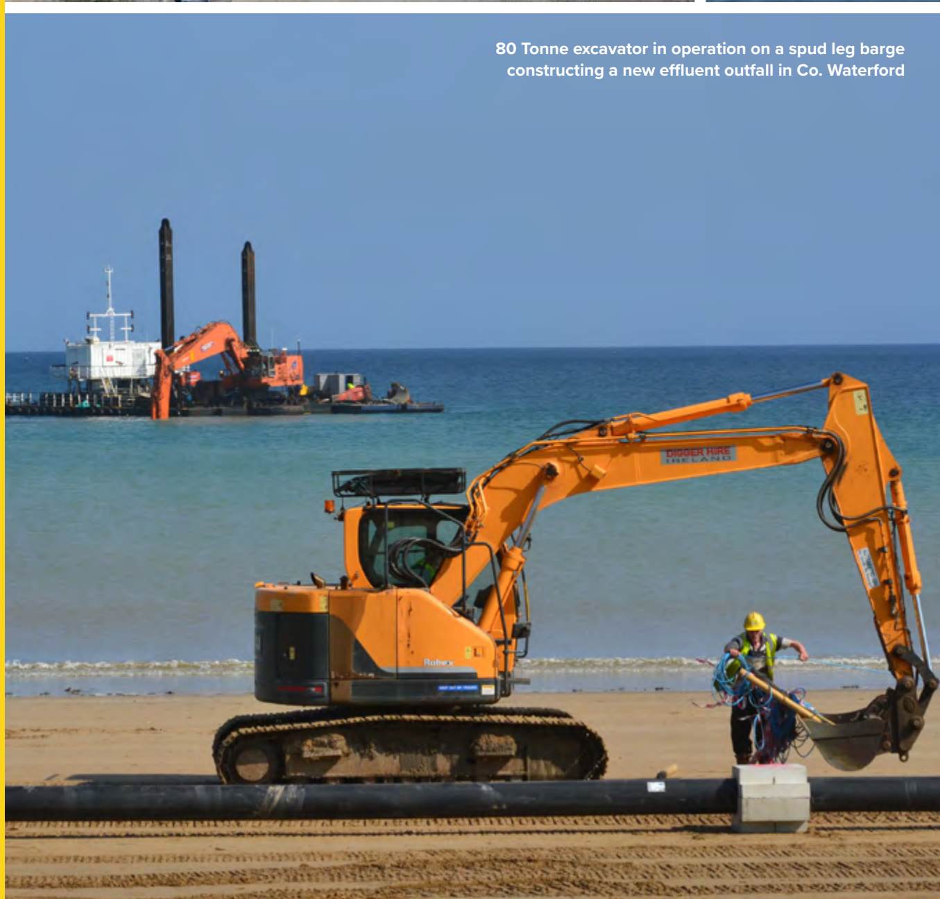
80 Tonne excavator in operation on a spud leg barge constructing a new effluent outfall in Co. Waterford