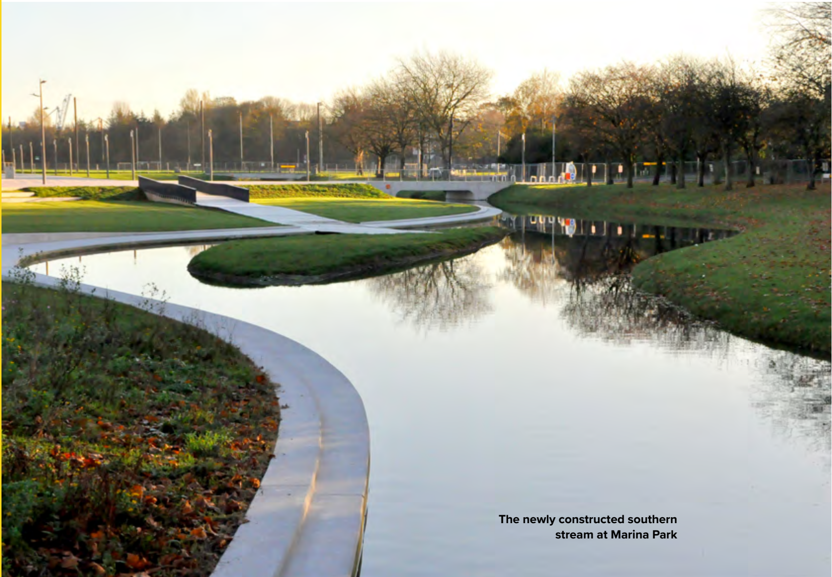
The newly constructed southern stream at Marina Park