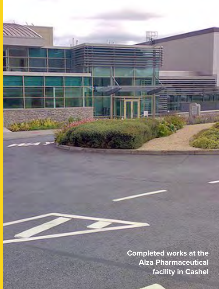
Completed works at the Alza Pharmaceutical facility in Cashel