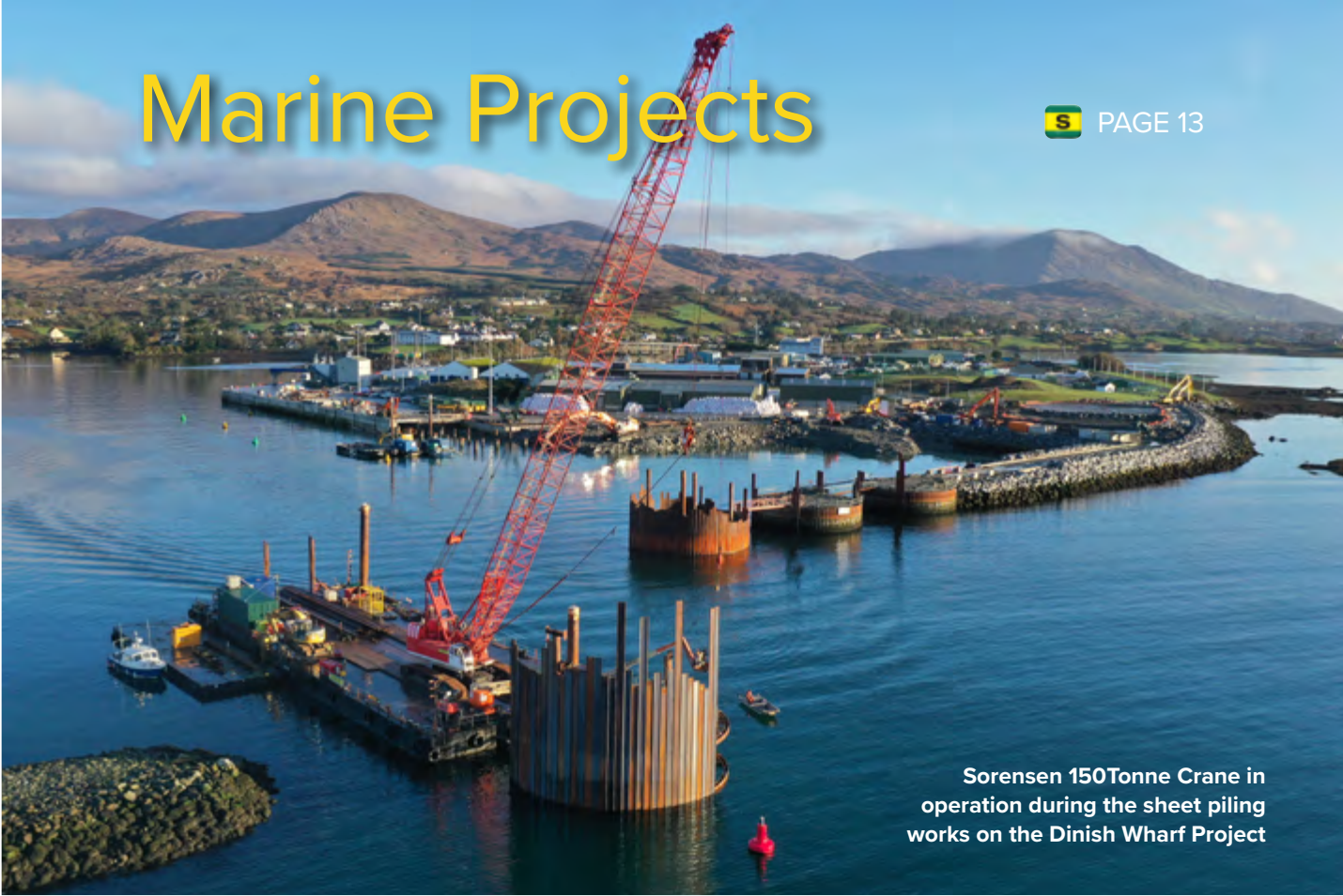
Sorensen 150Tonne Crane in operation during the sheet piling works on the Dinish Wharf Project