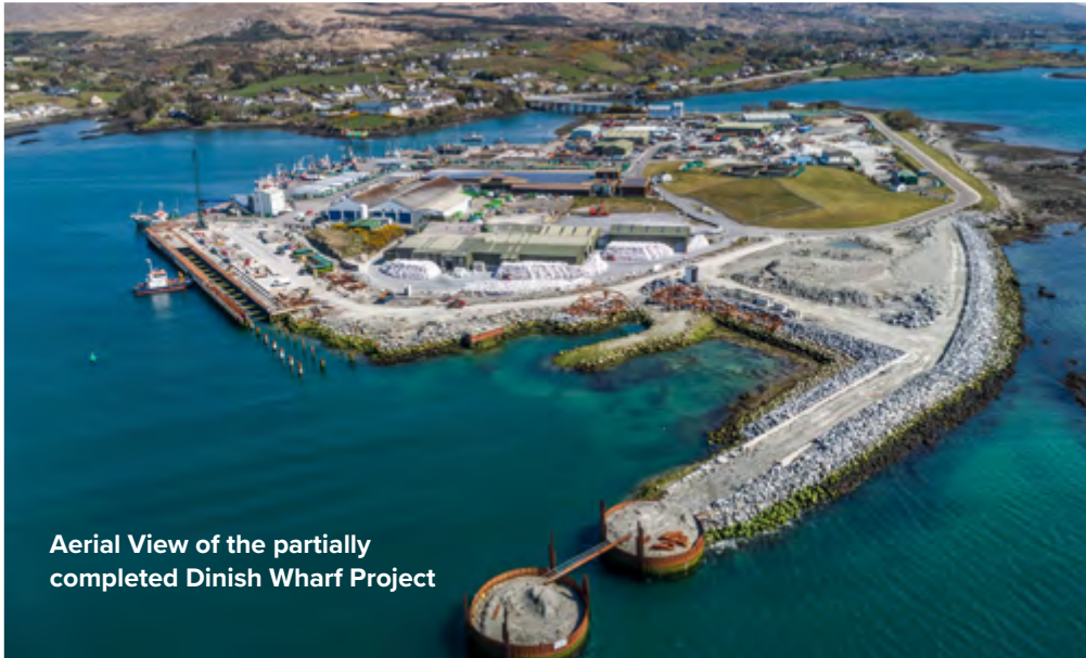
Aerial View of the partially completed Dinish Wharf Project