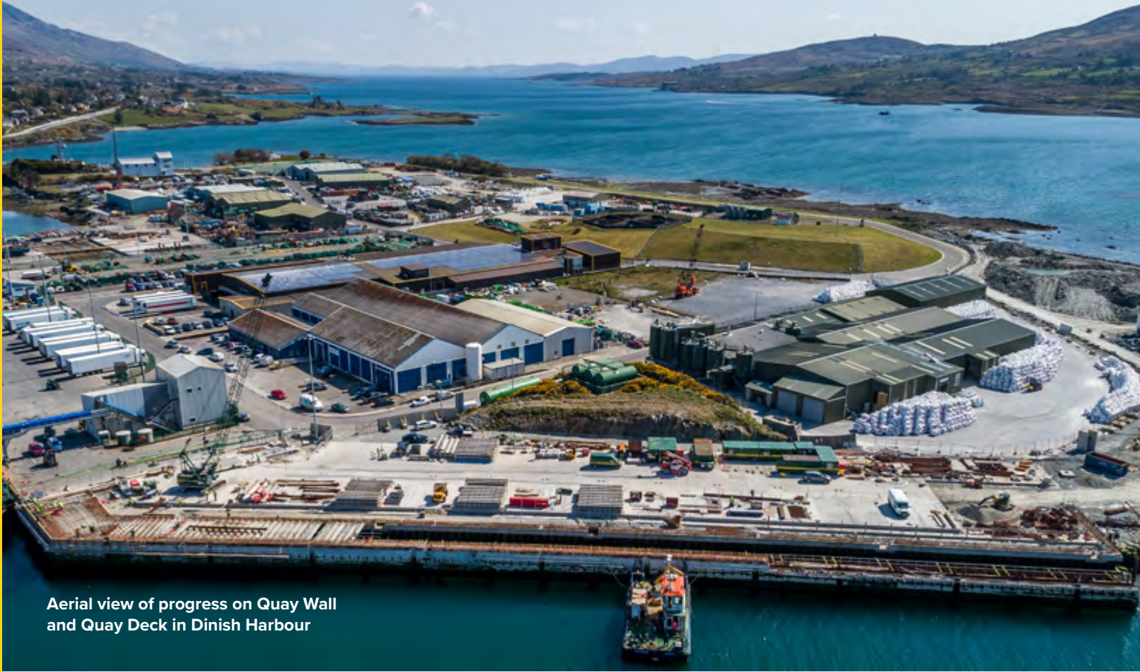
Aerial view of progress on Quay Wall and Quay Deck in Dinish Harbour