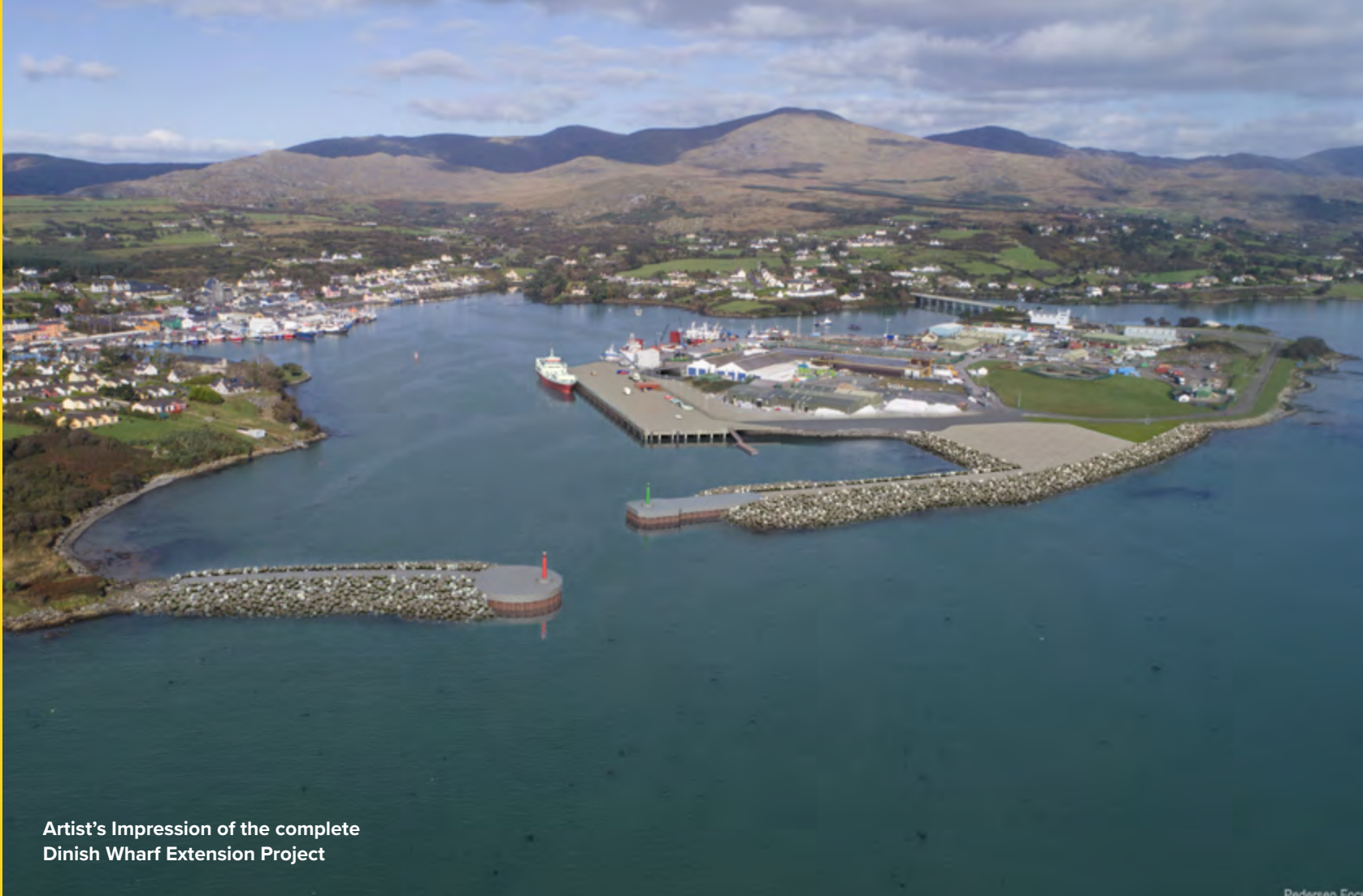
Artist's Impression of the complete Dinish Wharf Extension Project