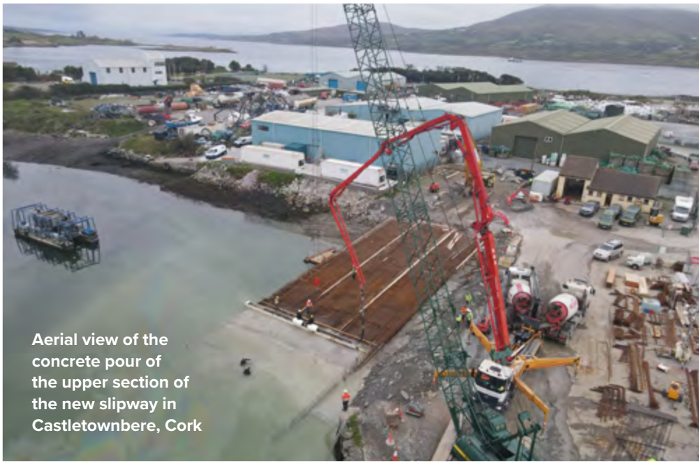
Aerial view of the concrete pour of the upper section of the new slipway in Castletownbere, Cork